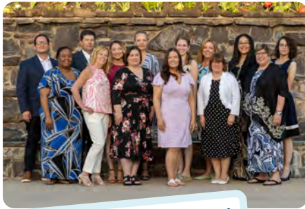
Mom's House Staff and Board