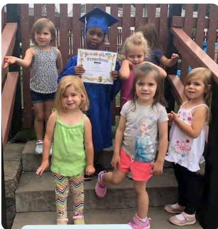
Friends for life