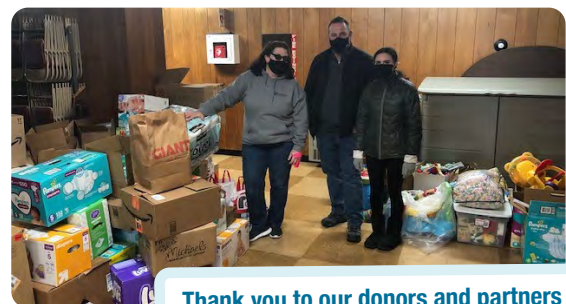
Thank you to our donors and partners for their generous support during COVID