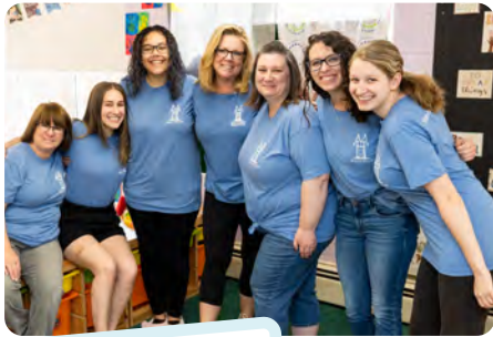
Mom's House Staff