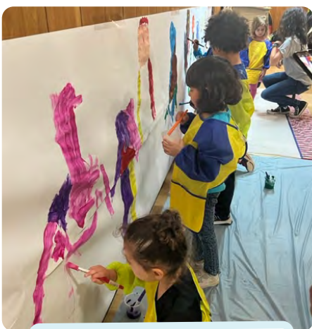
Fun with Barnstone Art for Kids